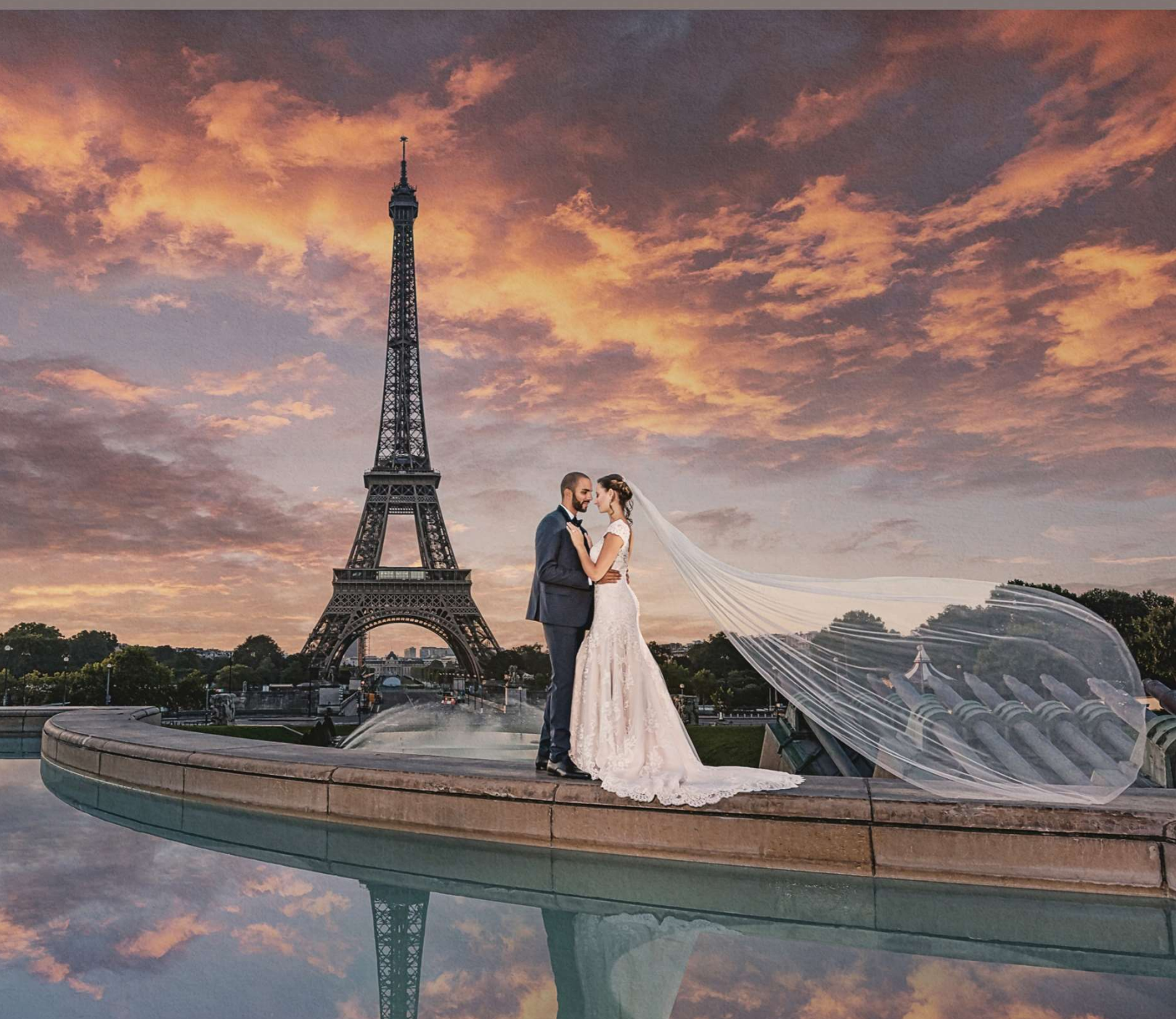
THE COMPLETE PLANNING GUIDE FOR OUR CLIENTS