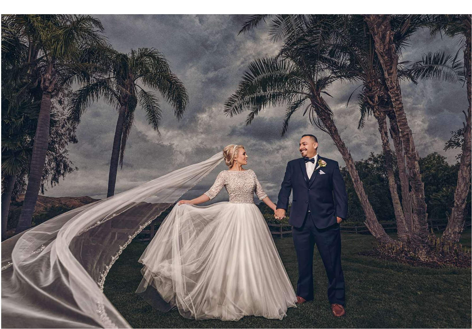
NadegeBarnes Professional Photographer since 2001

We know that coordinating every detail of your entire wedding can be a daunsting task. But, don't worry, we are here to help. We want to ensure that you have the best experience possible; therefore, we have created this guide on how to have the most perfect wedding ever—while also getting to remain relaxed and excited on your big day! Following these steps will give you the best experience, and ultimately the best result for your photos!